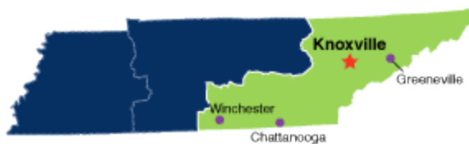
Image 2: Map of the United States District Courts of Tennessee West, Middle, and East (colored in green)

Source: U.S. Marshals Service. http://www.usmarshals.gov/district/tn-e/general/area.htm