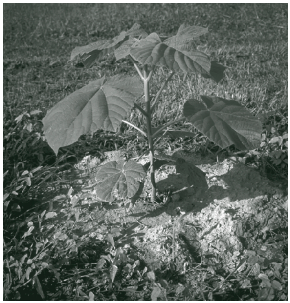
Paulownia may be planted as seedlings, rootstocks or root cuttings.

Paulownia was introduced into the United States as a landscape tree nearly 150 years ago and has since become naturalized in 33 states. When American sawmill companies became aware of strong markets for Paulownia in the 1970s, a cutting frenzy began. Very high prices were paid for slow-growing wild trees, largely because of their size and closeness of growth rings. These conditions created a demand for high wood quality desired for many Japanese products, especially instruments and other specialty items. Since most large wild trees have been cut, attention has shifted to growing Paulownia trees in plantations.