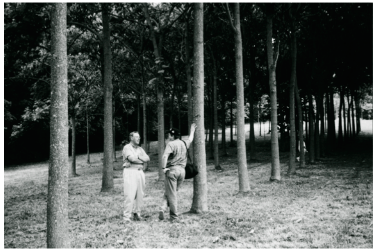
A 12-year-old, well-managed Paulownia plantation.