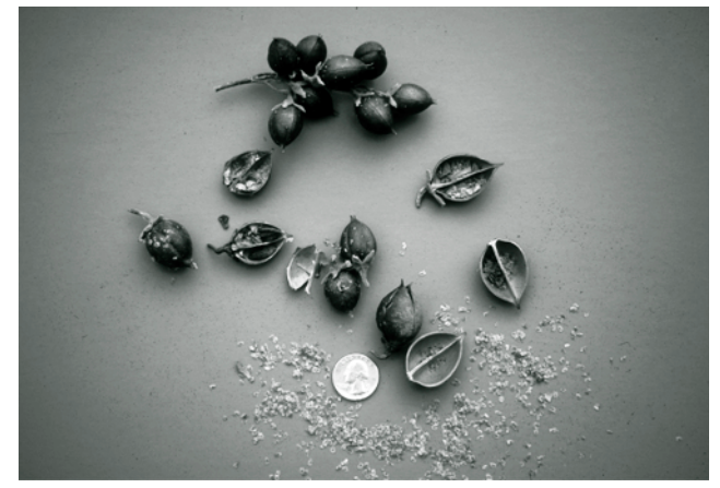
Each seed capsule of Paulownia may contain up to 1,500 seed. The small seed are easily disseminated by the wind.