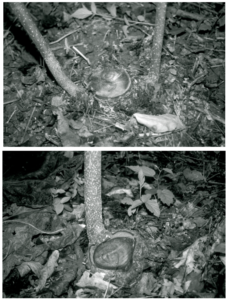
Coppicing young Paulownia stems result in better form and growth of the new sprout. Select coppice stems that originate at ground level (a), not those weaker sprouts that originate on the cut stem above the ground (b).

is necessary until after the stems are coppiced. Lateral branches form from buds located at the joint of the leaf stalk and the tree stem. Removing these buds and branches before they become woody allows the stem to remain branchless until the desired height has been reached. Prune buds and branches several times each year for three years after coppicing to maintain a clear stem. Do not overprune! A minimal live crown ratio (length of crown / total tree length) of 30 percent should be maintained.