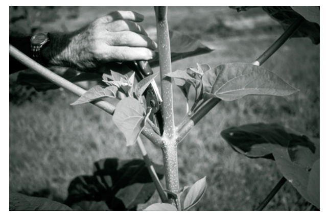
Pruning lateral branches that often form at the joint of the leaf stalk and the tree stem helps to keep the stem clear and straight.

acre. Some growers apply seedling protectors to each tree. Such protectors eliminate animal pest problems and also may reduce weed control, but they cost approximately $1 per seedling. These costs may be sporadic, if incurred at all, and are not included in the financial analysis.