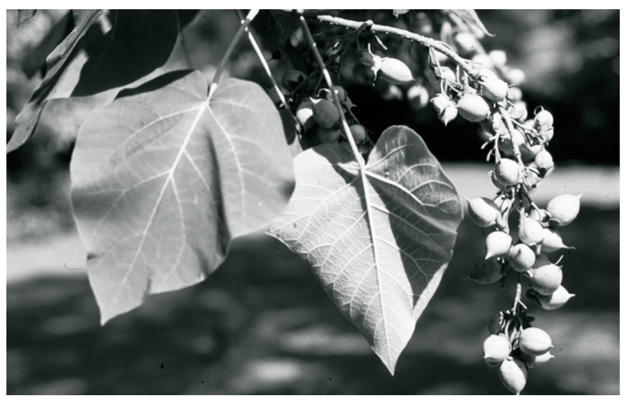
Large leaves and immature fruit clusters of Paulownia.

Table 4. Information sources for tree crops selection.