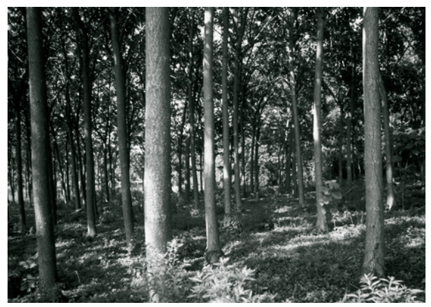
Paulownia plantations are suited for some marginal farmlands, if the soil is well-drained.

Thinning to control plantation density is not currently a common practice, because most existing plantations are too young to warrant this practice. Only older stands produce marketable lumber from thinnings. Since you will normally remove the poorest-quality trees, returns from thinning will be low.