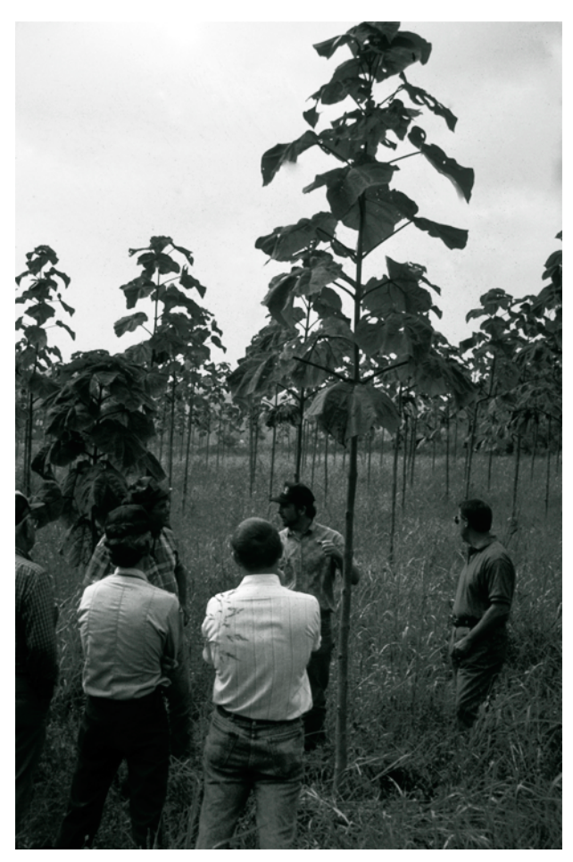
Sprout growth of Paulownia one year after coppicing.