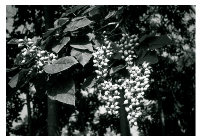
The seed pods of Paulownia mature in September or October and persist on the tree through the winter.