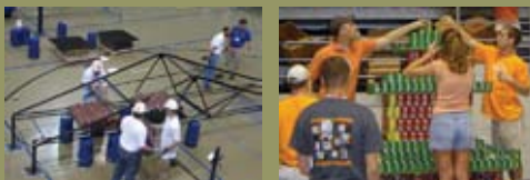
Members of the UT ASCE Student Chapter work on two of their award-winning projects: the Steel Bridge (left) and the Visual Display/Canned Goods Structure (right).

The National ASCE Committee on Student Activities awarded a Certificate of Commendation to the UT ASCE Student Chapter based on the chapter's 2005 activities. The certificate is awarded to the top 10 percent of student chapters in the country.