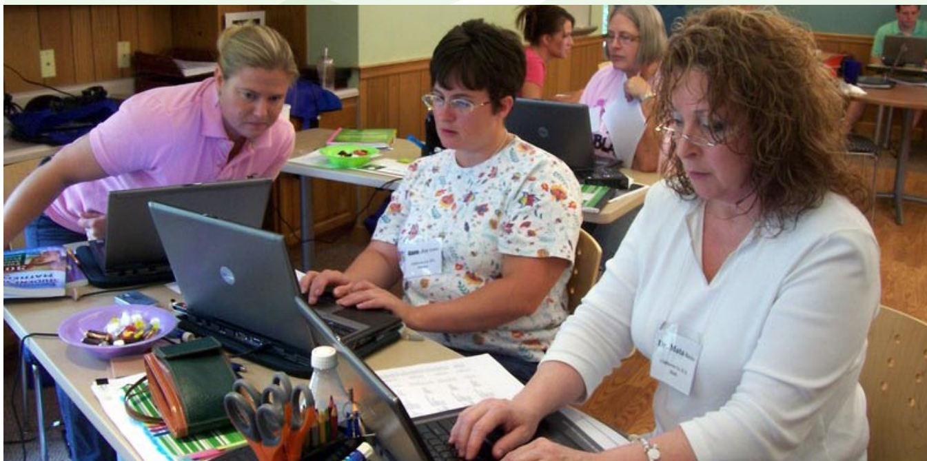
A team of mathematics and science teachers from Claiborne County discuss the progress of their integrated lesson.

NEWSLETTER FOR THE UT COLLEGE OF EDUCATION, HEALTH, AND HUMAN SCIENCES