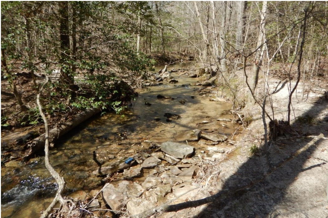
Figure 2. Sampling reach of Collier Creek, tributary to Brushy Creek in the Black Warrior River drainage, Winston County, Alabama 17 March 2016.

After initial observation of a large population of R. obtusus in Collier Creek, a second collection was made specifically to estimate population size and density in the stream (Figure 2). Using two 3.05 m seines, a 50 m stretch of the creek was blocked. To estimate population size, the stretch was sampled to depletion (three passes) by removal method (Zippin 1956, 1958, Lockwood and Schneider 2000) with a Smith-Root electrofisher and dipnets, working in an upstream direction and sweeping from bank to bank in the manner described by Barbour et al. (1999). The shocked area was left undisturbed for 30 minutes between passes. Captured fishes were removed from the stretch and processed after each pass. However, our triple-pass sampling of the 50 m reach collected fewer R. obtusus than expected, so we sampled an additional 100 m upstream with a single pass. Due to the small number of R. obtusus collected in our 50 m reach we elected to only calculate density per square meter instead of estimating population size, as we originally intended. Density for each species was estimated as the number of individuals from the first pass of the 50 m section plus individuals collected from the 100 m reach divided by the reach length times the average wetted stream width for the 150 m of stream sampled. Average wetted width was determined by 10 equally spaced transects within the 150 m reach.