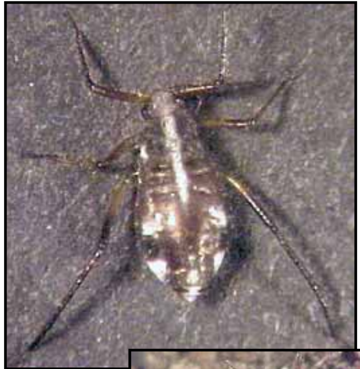
White Pine Aphid

Heavy infestations of aphids may kill young trees or may cause reduced growth. As the aphid feeds, it excretes honeydew. This sticky substance is the excrement from the aphid. A black sooty mold is commonly found growing on the honeydew. Sooty mold reduces the quality of trees and may reduce the amount of sunlight available to the leaves. Ants may also be found feeding on the honeydew.