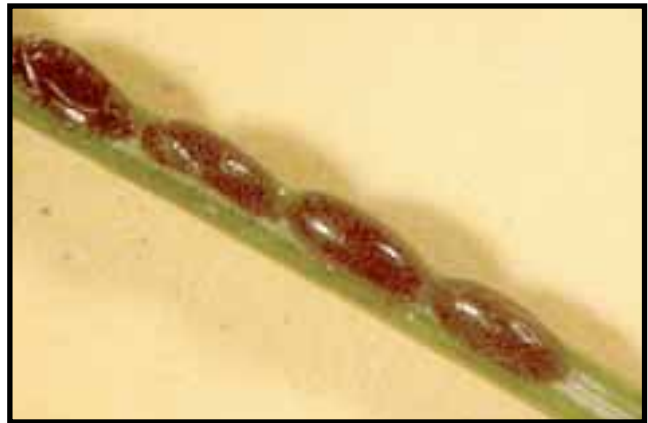
Eggs on needles.