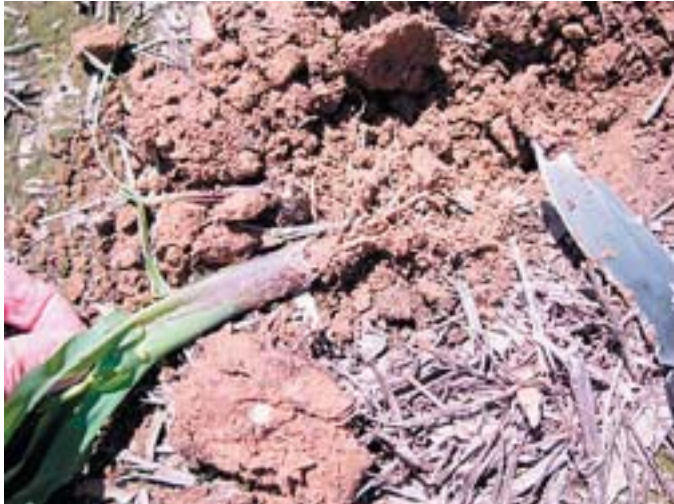
Damage by beetles.

Presently, no specific insecticides are labeled for field corn with the sugarcane beetle as a target pest. Some research in other states has shown that a granular insecticide, such as Counter 15G or Lorsban 15G, reduced beetle infestations when the insecticide was banded and incorporated into the row. Beetles may be partially controlled with a foliar insecticide directed at the base of plants at the full labeled rate using 20-30 gallons of liquid per acre. Most infestations of the beetle in field corn in Tennessee are so unpredictable that research efforts have not been successful. It would be advisable to watch the progress of this insect and to be aware of its potential to cause serious damage in corn.