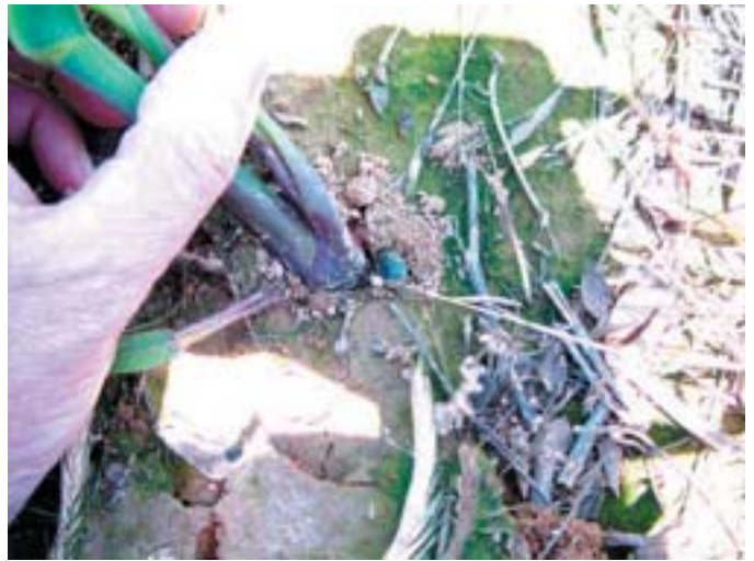
Checking for beetles. Forty percent of corn plants on this field were destroyed by beetles.