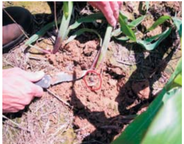
Adult Sugarcane Beetle

The adult beetle overwinters in the soil in Tennessee, with only a single generation each year.