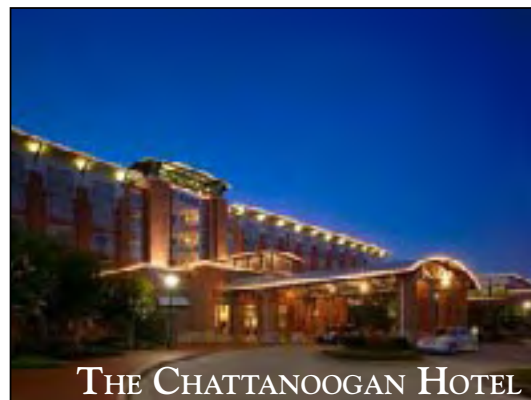
THE CHATTANOOGAN HOTEL

IPS ANNUAL CONFERENCE AUG. 8-10 CHATTANOOGA