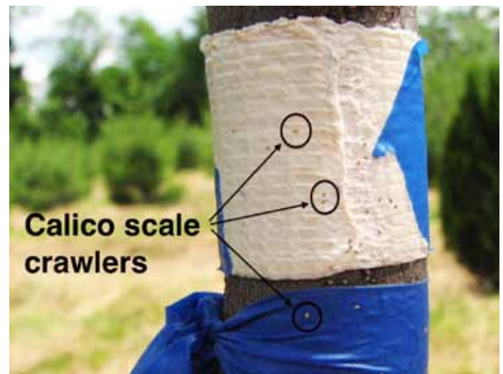
Figure 2. Double-sided tape placed around the trunk above females can detect calico scale crawler emergence.

Overwintering life stage – Acer (Northwood*, 'Legacy'*; Green Mountain* A. campestre *), Celtis * and Zelkova *. Scout for immature second-instar females, which are oval, almost flat in profile, and gray to black. Also, scout for signs of an infestation during the previous season. Look on trunk, especially at nodes and behind stakes for dead adult females on the bark or light-colored round circles where females were attached to the bark. Record presence/absence on 15 plants of each cultivar. http://utuknurseryipm.utk.edu