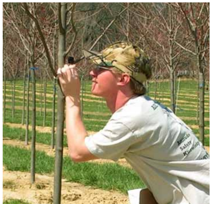
Figure 1. Scout for overwintering maple mites at the branch collar.

Nursery growers indicate that they use IPM practices but some components to IPM are not widely adopted because demonstrated success is needed, IPM takes too much time to implement and nursery-specific IPM information is not readily available (Hoover et al. 2004 and LeBude et al. 2012). Application of IPM to nursery crops is limited, because validated, standardized protocols and corresponding action thresholds have not been published (Adkins et al. 2010, LeBude et al. 2012).