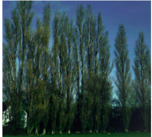
Lombardy poplar in decline.

Choices of other trees to plant with this crown form include the 'fastigate varieties' of hornbeam, alder or oak.