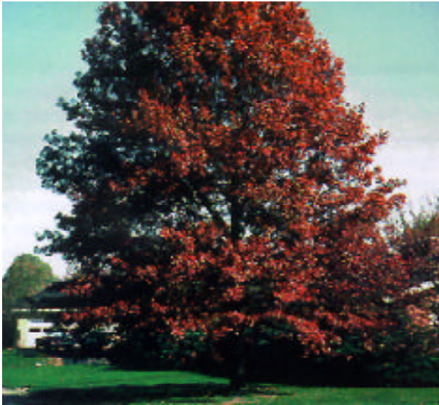
Fall color and large size of pin oak.

Pin oak is a wonderful urban tree where adequate space is available for full development and where soils are in the acid range (lower pH).