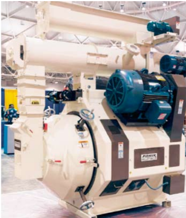
In a pellet mill, large electric motors compact wood particles and extrude them as pellets through small openings in steel dies.