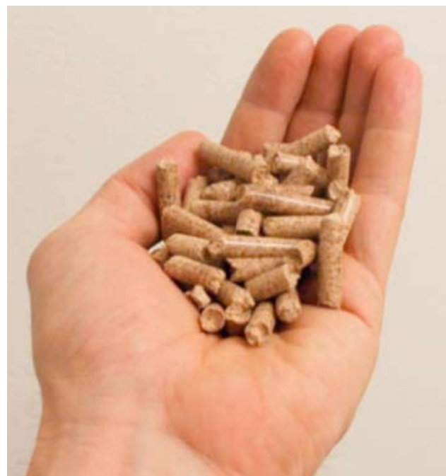
Pellets are a clean and convenient form of wood fuel.

Pellet-burning stoves are more expensive than wood-burning models ($1,600 to $3,000), but require