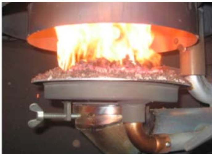
Wood pellet stoves are very efficient – they can capture almost 95 percent of the heat energy contained in the pellets.

Once the pellets are formed and cooled, they are packaged in bags or stored in bulk. Most residential pellet users buy pellets by the ton, which consists of 50 40-pound bags packed on a pallet. The pellets may also be placed in small silos outside of the user's home by a delivery truck. Pellets can be stored indefinitely but they must be kept dry to prevent deterioration.