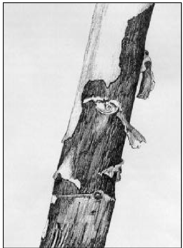
Figure 3. Black, deteriorated lower stalk of black shank-infected plant.