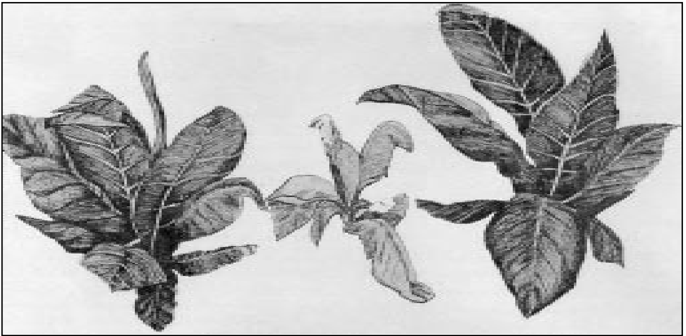
Figure 1. A wilted shank-infected plant between two healthy plants. The wilted plant will usually turn yellow.