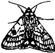
Figure 3. Adult moth

Since corn earworms are cannibalistic, usually only one or two larvae develop in the ear. The kernels near the ear tip are generally damaged. After completing their development, the larvae bore out of the shucks, drop to the ground and burrow into the soil to pupate. Two to three weeks pass before a new generation of moths emerges. At least three generations occur each year in Tennessee.