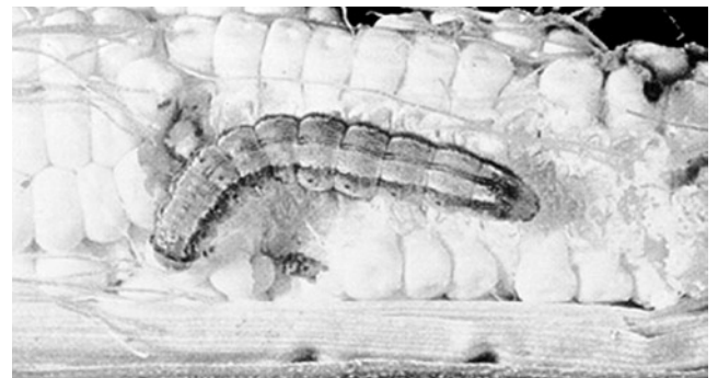
Figure 1. Larva feeding on kernels

Each female may lay from 450 to 3000 eggs. Eggs are \frac{1}{32} -inch in diameter. When first laid, eggs are pale white. Prior to hatching, a pale reddish band forms; then the egg darkens. Eggs hatch in two to five days and newly hatched larvae crawl down into the tip of the developing ear to begin feeding. Larvae develop through five or six instars (the larval stages between successive molts) while feeding for two to three weeks.