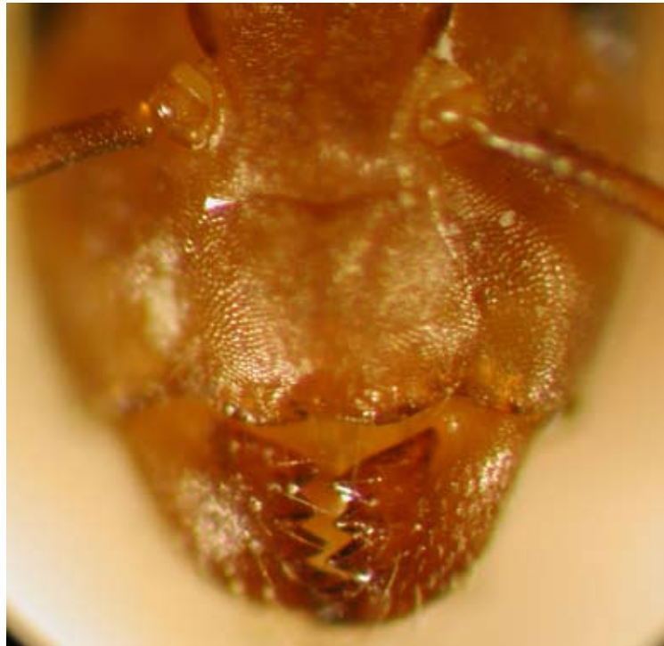
Figure 1. The carpenter ant's sharp mandibles are used for removing wood.

their mandibles and spraying formic acid from the end of their abdomens into the wound. A circular fringe of hairs on the end of the abdomen allows the ant to direct the spray.