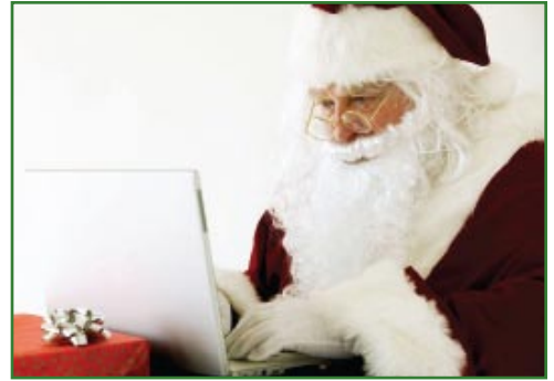
Even Santa Claus could not operate without some help from IPS.

While Santa is enjoying a good rest now, IPS is getting a fast start to the New Year. Keep an eye on The Exchange in February to read about what the IPS CO staff will be doing in 2008. Happy New Year!