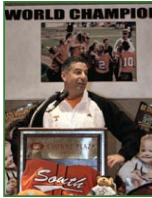
Bruce Pearl, UT men's basketball coach, at the COAT fall conference.

The opening session featured Bruce Pearl, University of Tennessee (UT) Knoxville men's basketball coach, and honored the 2007 Little League Girls Softball World Champions from Morristown, Tenn. After Pearl's speech, he posed for pictures and signed a multitude of autographs.