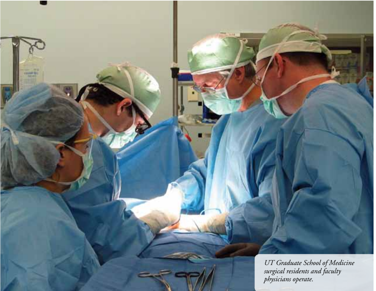
UT Graduate School of Medicine surgical residents and faculty physicians operate.